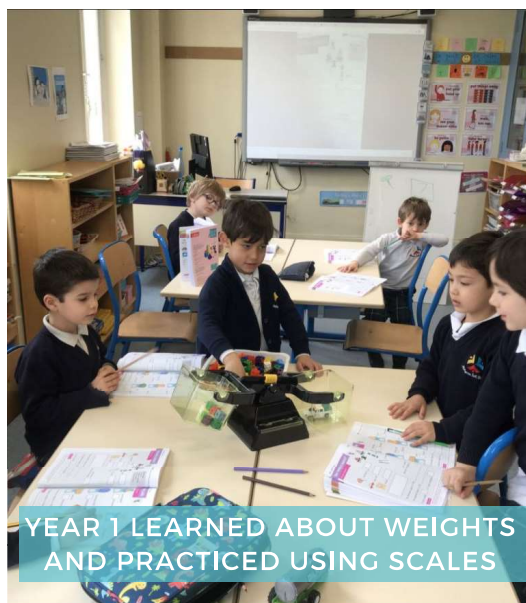
YEAR 1 LEARNED ABOUT WEIGHTS AND PRACTICED USING SCALES