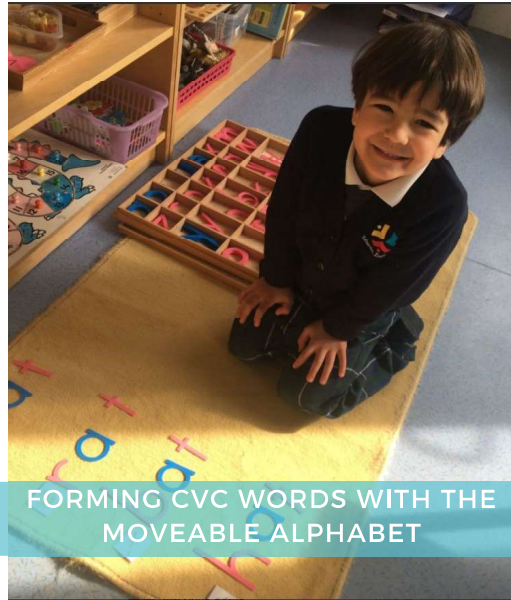
FORMING CVC WORDS WITH THE MOVEABLE ALPHABET