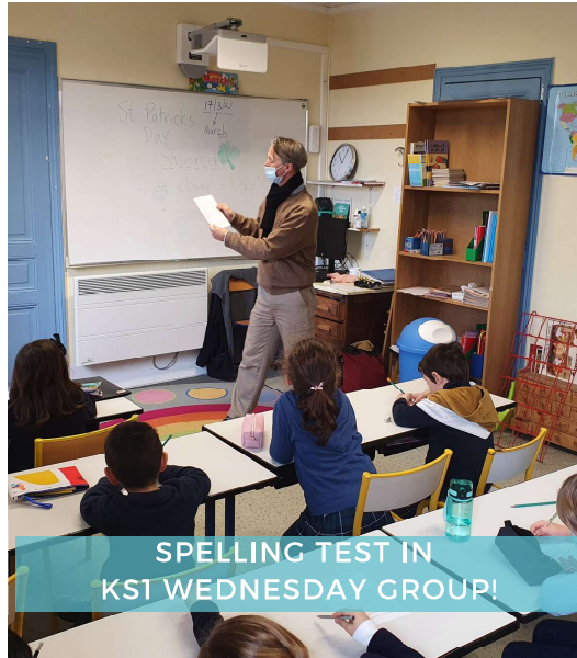
SPELLING TEST IN KST WEDNESDAY GROUP!