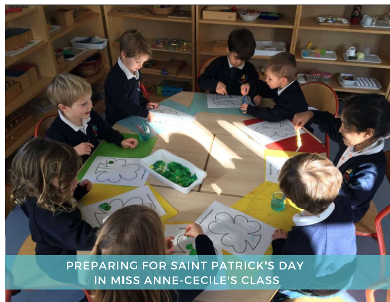
PREPARING FOR SAINT PATRICK'S DAY IN MISS ANNE-CECILE'S CLASS