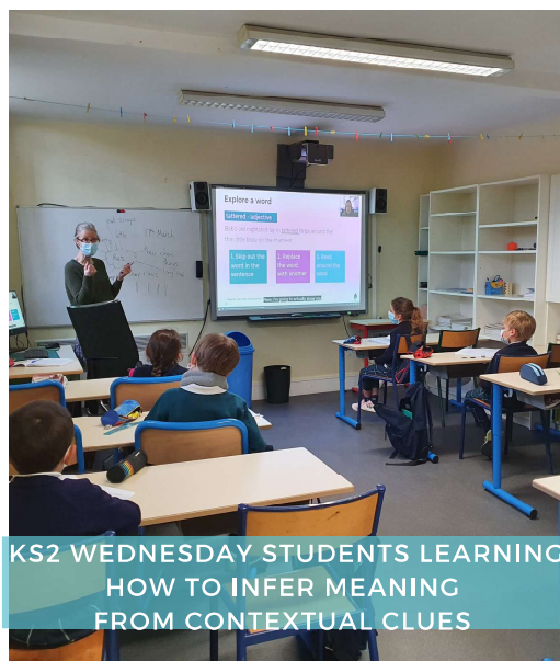
KS2 WEDNESDAY STUDENTS LEARNING HOW TO INFER MEANING FROM CONTEXTUAL CLUES