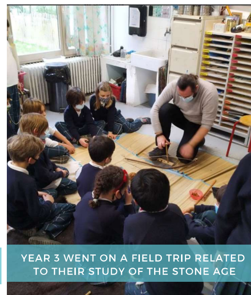
YEAR 3 WENT ON A FIELD TRIP RELATED TO THEIR STUDY OF THE STONE AGE